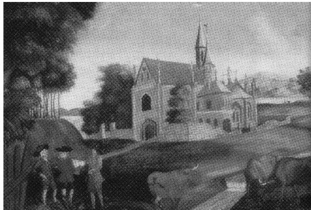
The Anglican Church governed every aspect of life in colonial Virginia.

The two religious sects could not have been more different. Transplanted by the first English settlers to Virginia and to other Southern colonies, the Anglican Church governed every aspect of colonial life. Colonists were required to attend Sunday services and to contribute corn and tobacco, as well as livestock, to support the church. Anglican services were elaborate and formal and did not encourage personal involvement.